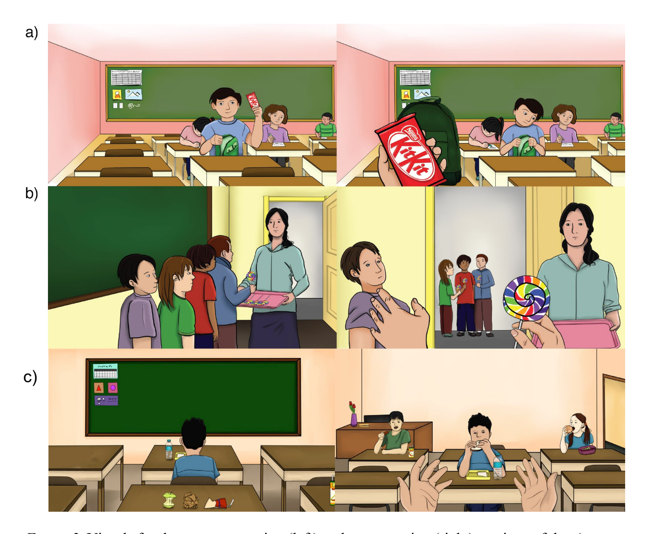
Figure 2. Visuals for the pretransgression (left) and transgression (right) portions of the a) chocolate bar, b) lollipop (i.e., ethical transgressions), and c) lunch (i.e., nonethical transgression) stories.

Note. All rights reserved © (withheld for peer review).