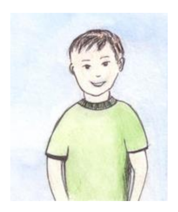
Figure 1. A picture depicting a not needy (i.e., happy) child. Notes . The experimenter showed the above picture and a box, and read the participating child following instructions: "Now let's take a look at another boy. He is happy. Ok, you can now choose if you'd like to give some stickers to him, or not." A total of 9 pictures were shown and children were given 6 stickers for each picture. This characteristic was later collapsed with the "child with lots of toys" characteristic to create the "not needy" condition.